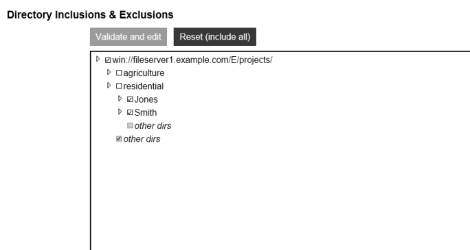
Figure 5.1: Directory Inclusions & Exclusions

Branches of the tree are collapsed automatically as new branches are expanded. However, directories representing the top of an inclusion/exclusion remain visible even if the parent is collapsed.